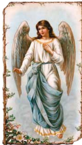
Ref: The Angel Bible, Hazel Raven

Explore the profiles of numerous readers with strong ties to the Angelic realm on our website: www.psychiclight.com/psychics/